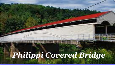
Philippi Covered Bridge